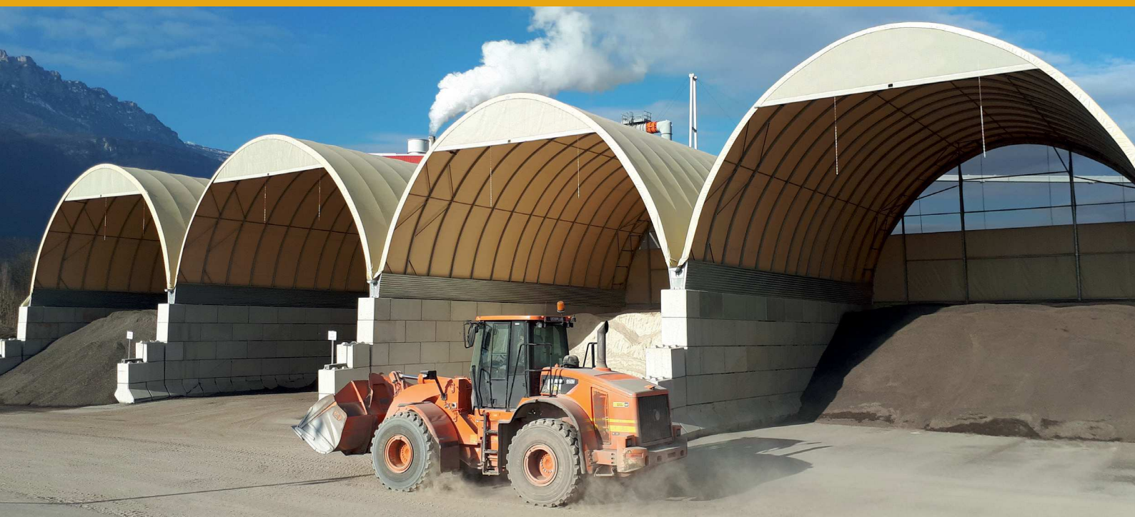
Bulk storage - Big-bag - Equipment - Worksite